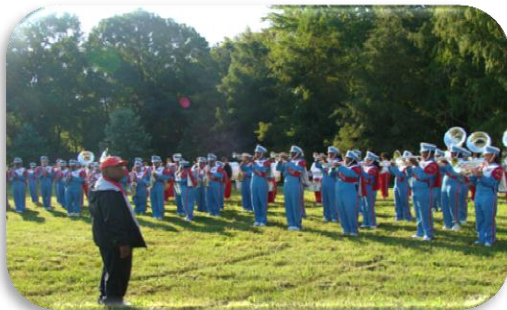
Delaware State University's "Approaching Storm" band performs for the cause!