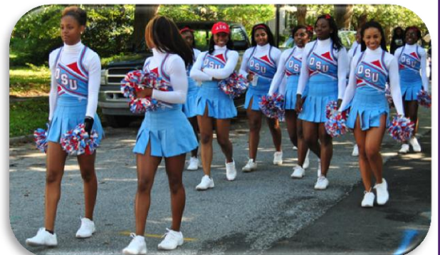
Delaware State University Cheerleading Team