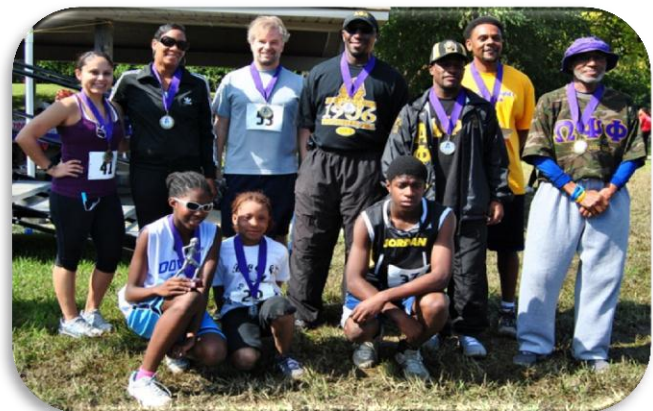
CONGRATULATIONS TOP RUNNERS!!!