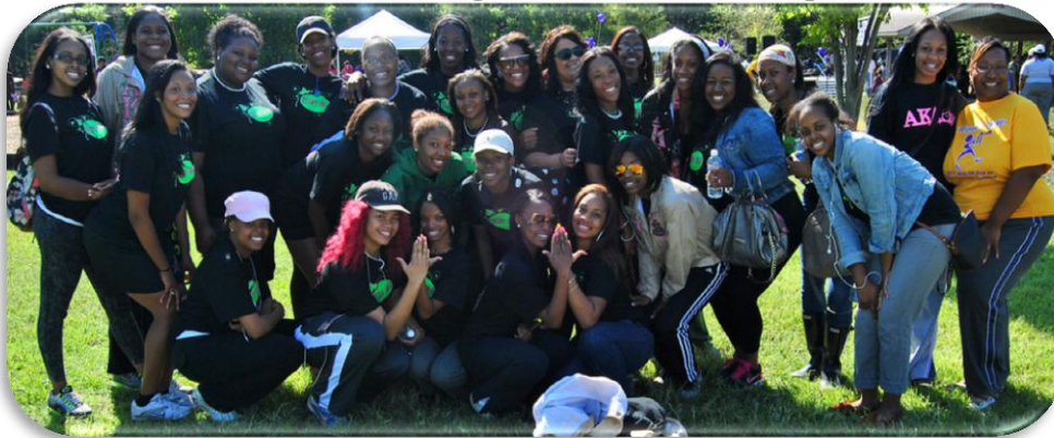
Members of Alpha Kappa Alpha Incorporated