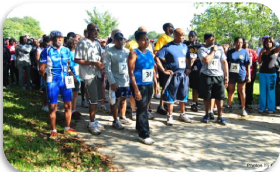
On your marks, get set, GO!!!