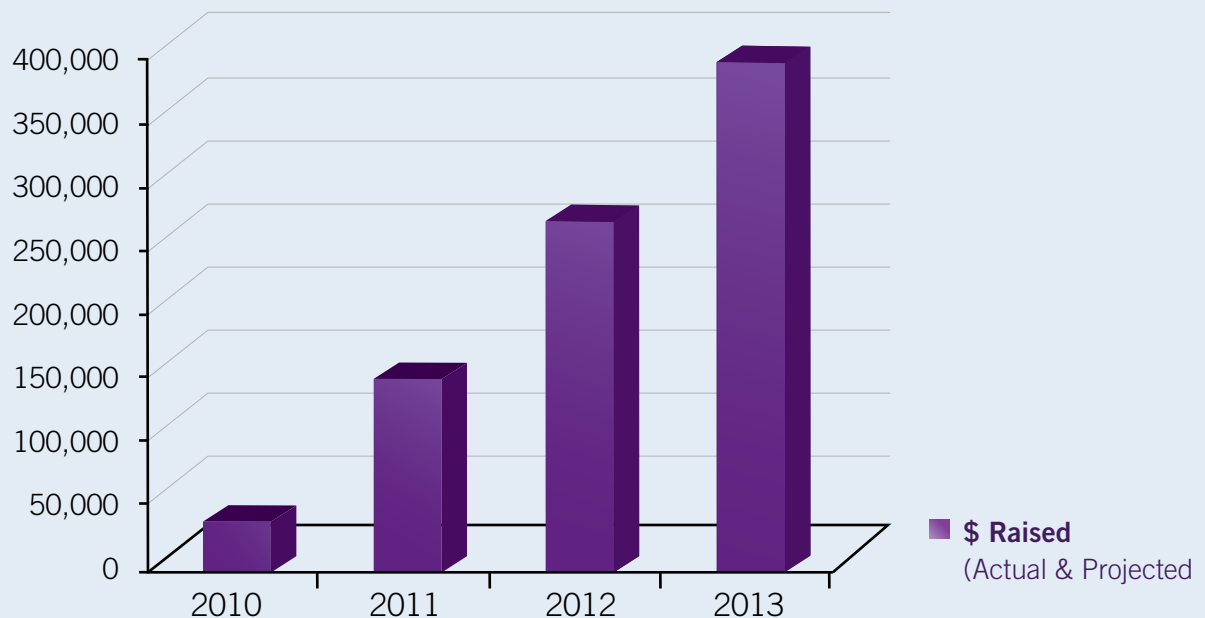
WITNEY'S LIGHTS PROJECTED GROWTH (2010 – 2013)